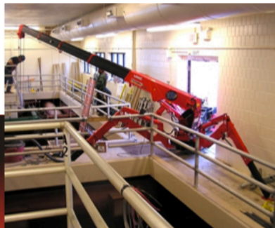
Gets into areas with tight or limited accessibility