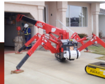
Great for construction, landscape, and contractor applications