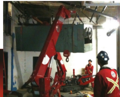
Jib Attachment for extra headroom